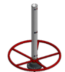
Manual Steering Wheel